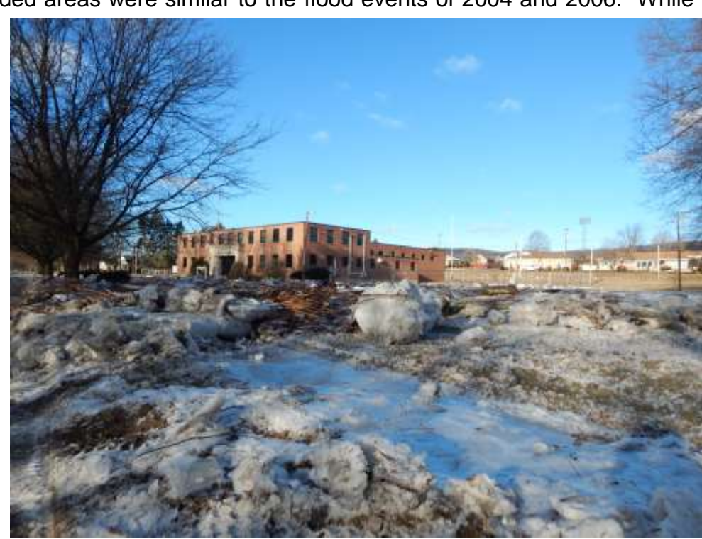
Figure 2 Susquehanna River January 25, 2018

Uncertainty regarding when the ice jam might break, where it would break, what areas would be inundated, the size of the ice blocks, and the possible loss of power and heat forced officials to