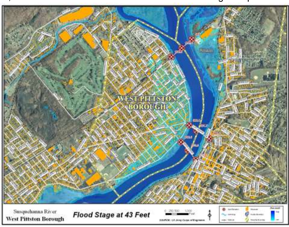
Figure 1 Tropical Storm Lee Flood Inundation West Pittston Borough

The Wyoming Valley Levee System prevented approximately $5 billion in damages. Unfortunately, not all areas of the Wyoming Valley escaped unharmed. Nearly 3,000 properties in unprotected communities were flooded. West Pittston nearly one third of the Borough was