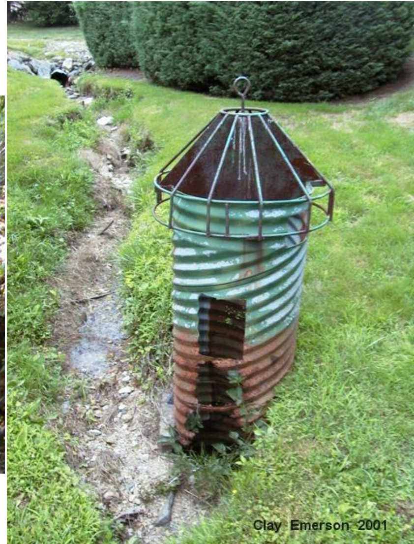
Clay Emerson 2001