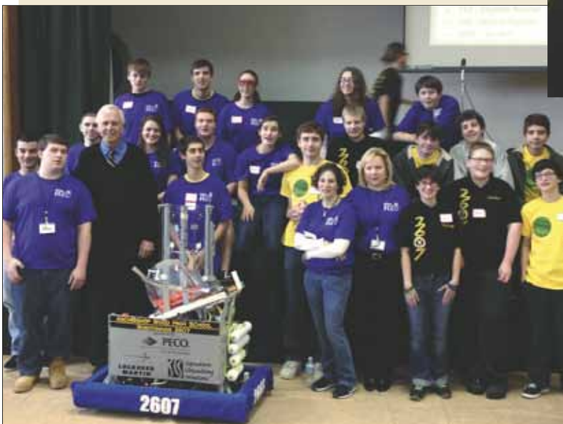
December 14, 2013 - Senator Greenleaf attended a robotics team competition at Archbishop Wood High School, home of FRC Team #2607, the Fighting Robovikings.