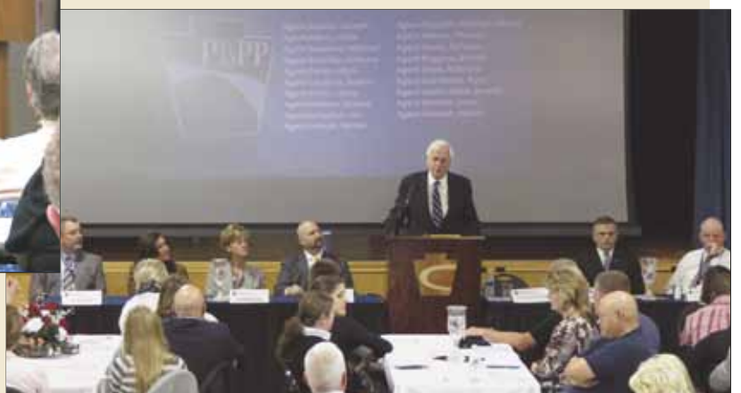
November 1, 2013 - Senator Greenleaf spoke to the graduating class of state parole agents at the PA Board of Probation and Parole.