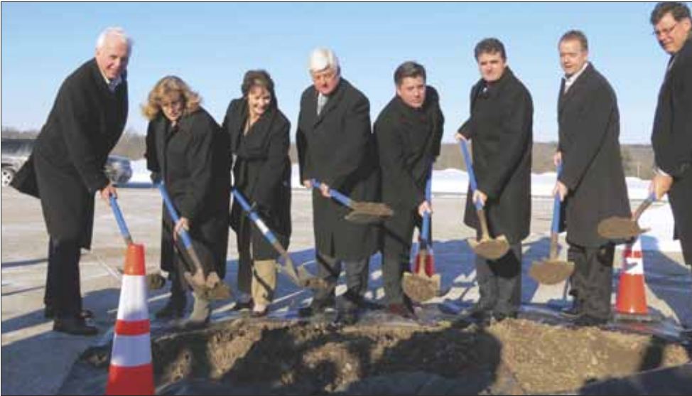
January 24, 2014 – Senator Greenleaf joined state and federal officials and legislators at a groundbreaking ceremony at Middle Bucks Institute of Technology for a $31.5 million improvement project for York Road between Bristol Road in Warminster and Sugar Bottom Road in Warwick. Improving our transportation infrastructure is the foundation of commerce and sustaining a healthy economy.