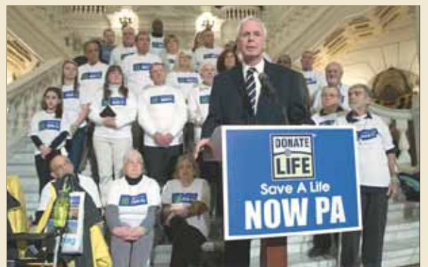
November 19, 2013 - Advocates for Senator Greenleaf's SB 850, the Donate Life PA Act, held a rally at the State Capitol advocating for the legislation that would help to increase organ donation in Pennsylvania.