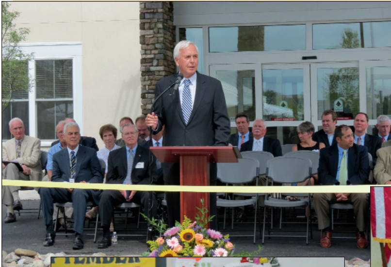
(Left) July 23, 2013 — Christ Home Retirement Community received a Senate citation in honor of their 90th anniversary. The event was held at their newly constructed residential facility in Warminster.