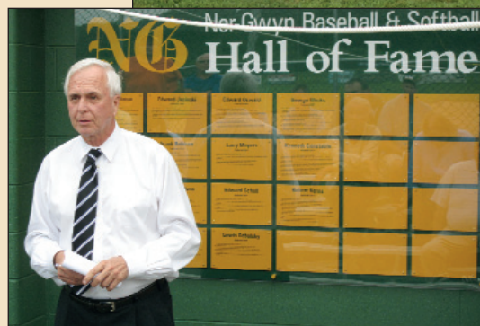
August 7, 2013 — New inductees to the Nor-Gwyn Baseball Hall of Fame received a congratulatory Senate citation.