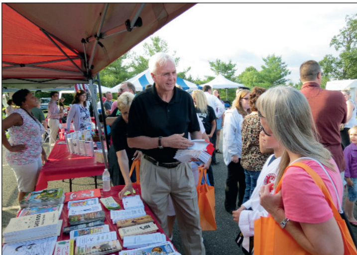
August 6, 2013 — Franconia Township held its annual National Night Out Against Crime.

SB 81 will now go to the House of Representatives for consideration.