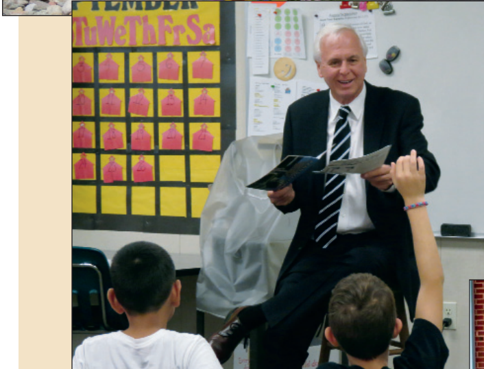
(Above) September 26, 2013 — Fourth graders at Penn View Christian School in Souderton were eager to answer questions about state government and learn about the job of a legislator.