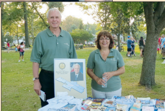
August 20, 2013 — My staff and I regularly attend events throughout the 12th District to meet with constituents and help with any state-related matters.